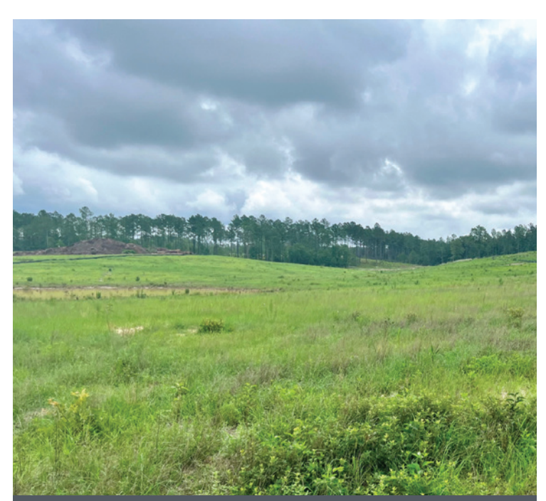
What will be the 8th tee box

He moved to the U.S., realized clubs were a terrific way to grow friendships and networks while having fun, and joined a few as he moved around the country. "I never bought homes,