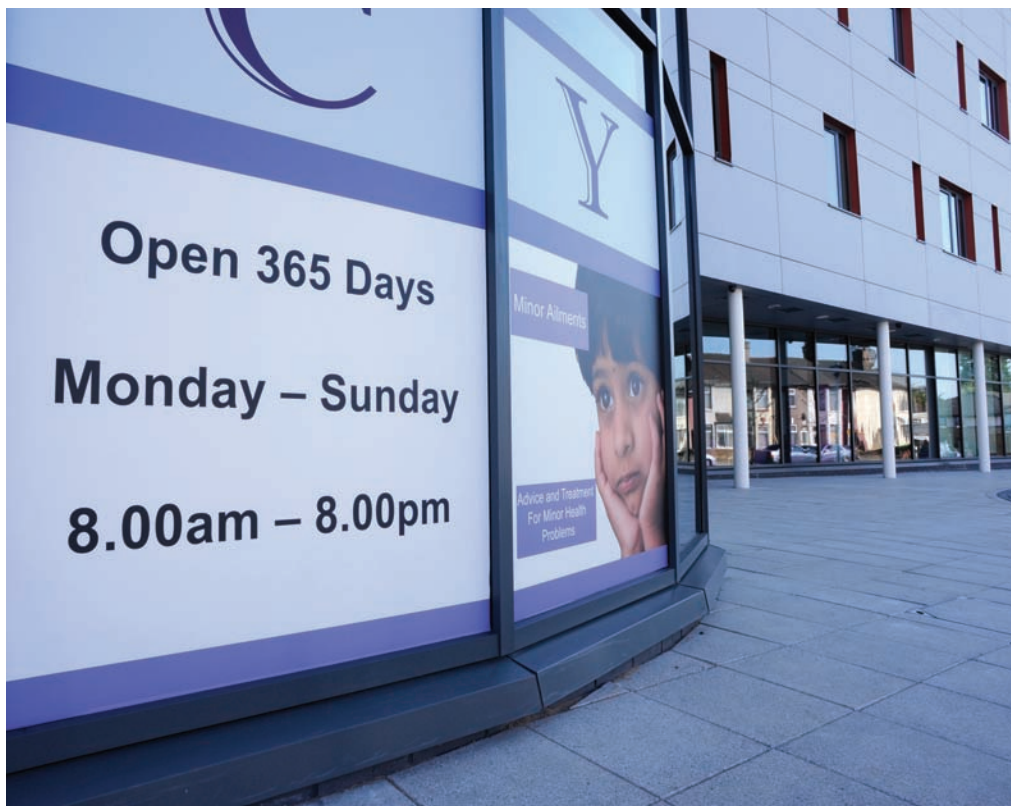
Trusts are paying an average of £180.92 per registered patient to GP-led health centres in their first year

A few trusts revealed providers would be paid progressively